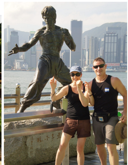
Walk of Fame with Bruce Lee