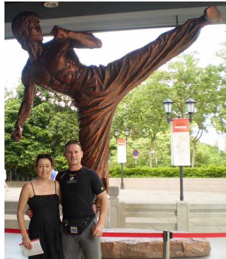
Bruce Lee Museum