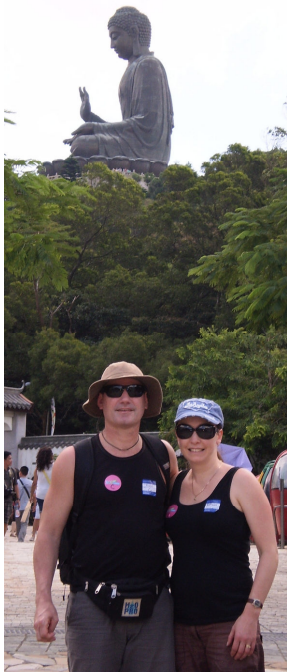
Giant Buddha Lantau Is.