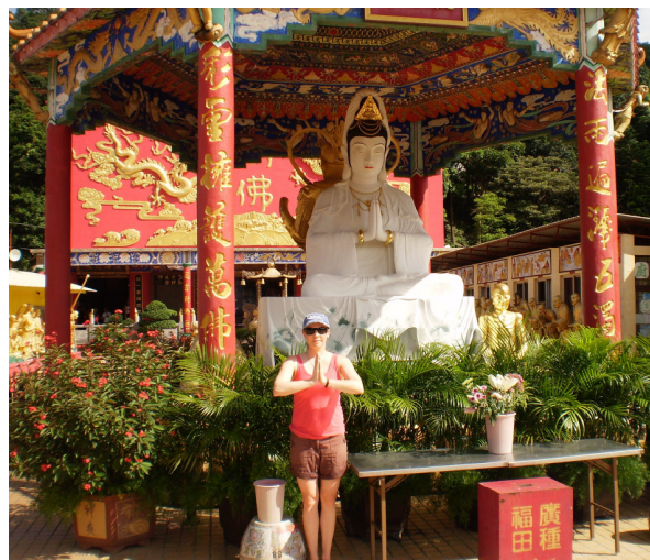
10,000 Buddhas & Temples