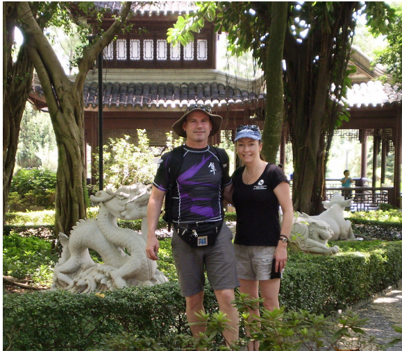
Kowloon Walled City